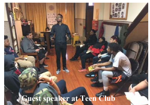
Guest speaker at Teen Club